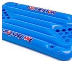
Ideas for grown-up party games Jul 25, 2017