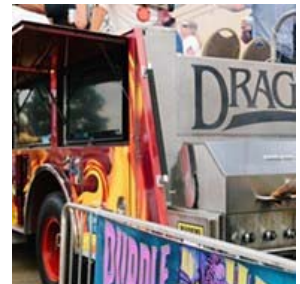
Four classic New Orleans restaurants that bring the food to you Jul 25, 2017